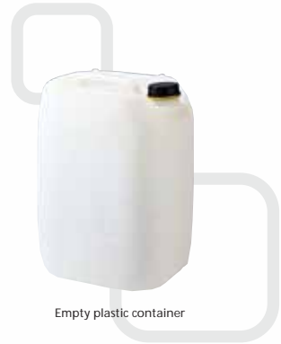
Empty plastic container