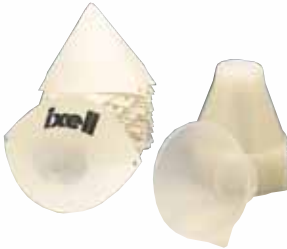
Cone disposable paper filter