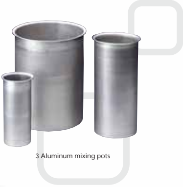
3 Aluminum mixing pots