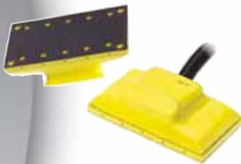
Oxycut dust extraction handblock