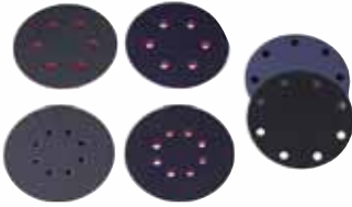
PSA 6 holes backing pad