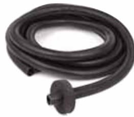
4 m air hose connector