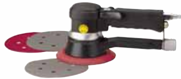
Dust extraction orbital sander