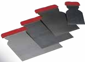
4 Metal spreaders