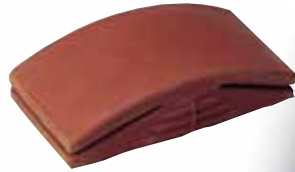
Rubber flattening block