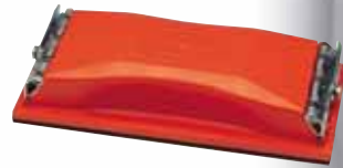
Sanding block Kaupp GM