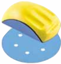
Abrasive velcro disc handblock