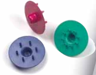
6 holes backing pad applicator