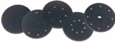
Plain foam backing pad